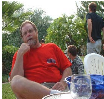
summer I am goin g to be ta